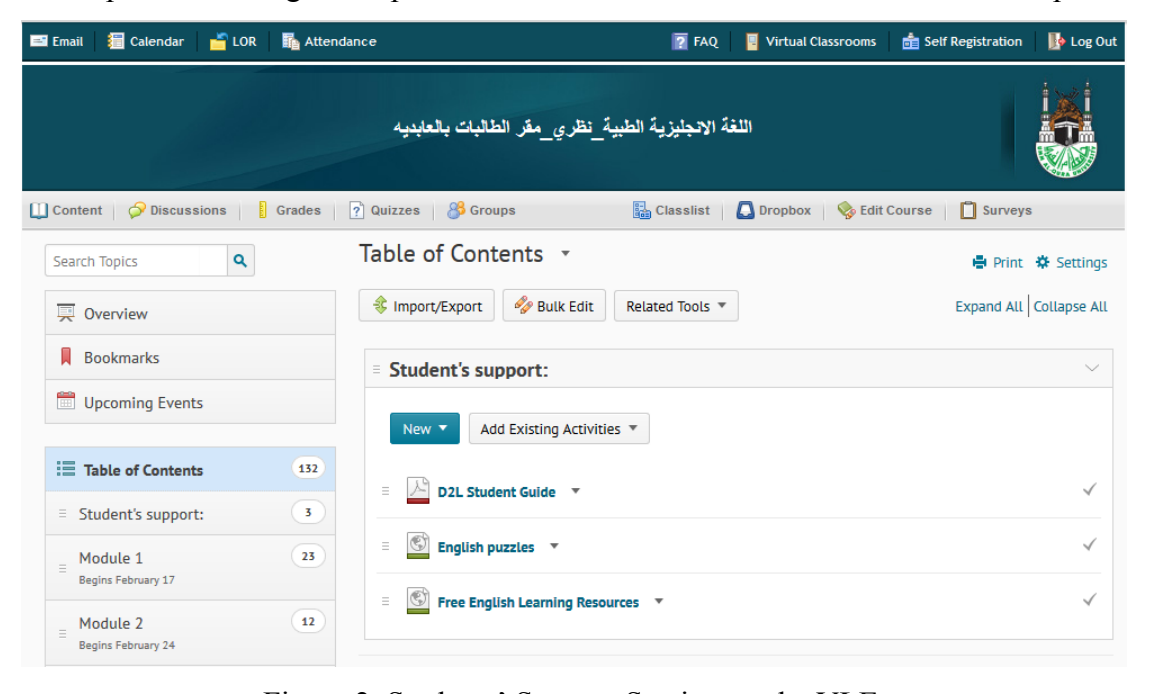
Figure 2. Students' Support Section on the VLE

Support is also exemplified in the HELP resource which was added to the SALL main content section. This additional block allows access to any element that offers support to learners such as the VLE manual for learners as users, English puzzles, and many other free self-access English learning resources (Figure 2). This support helped to elevate learners' motivation when they find what they needed to know about the use of the VLE as they were heard talking inside the classroom about how the manual helped them to deal with Desire2Learn and they were sharing tips on how to use it. Learners who consulted the additional self-access language learning resources were more engaged with the learning experience and that was seen in their performance of all of the tasks, including optional ones, their continuous synchronous and asynchronous interaction with the teacher and peers, and their attempts to encourage their peers to check out different elements of the SALL space.