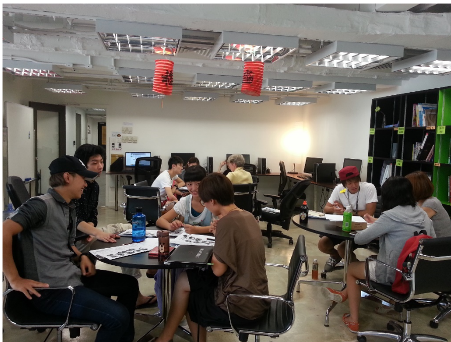
Figure 1. Inside the LLC

Several centre managers had stated that learners prefer advising to take place in the main space, rather than a separate room. They note that seeing advising in action encourages other learners to use the service. It was recommended to have administrative staff, advisors and centre managers in full view of the learners. In larger institutions where managers have separate offices, they spend part of the day in the centre, available to engage with staff and learners alike. My experience indicates that learners can engage in self-study while others work with advisors nearby and that learners and advisors both enjoy being able to interact with centre staff informally. However, I have also found that not having a quiet space to retreat to makes it hard to think and write when the centre is busy.