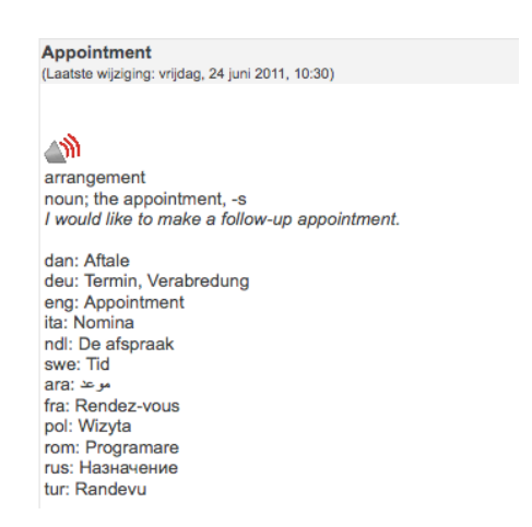
Figure 3. One Entry from the MoM-basic Wordlist

To effectively foster contextualised learning, the words and terms are also arranged in interactive wordmaps where they are grouped by topic/semantic fields, as shown in Figure 4 (Swanepoel & Van de Poel, 2002).