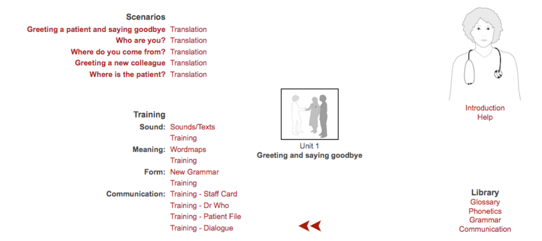
Figure 1. Overview of Unit 1 Content

The online version of MoM-SA and the course book derived from it contain ample opportunities to learn, internalise and extend general and specialised medical vocabulary at a basic level. Lexical items are presented in the context of a written scenario, with audio support and translation into six languages (for the basic course the topics covered are Greeting, Examining and instructing, History taking, Symptom analysis, Case presentations, Emotions, Explaining results, The management plan, Planning and Problem solving. See Figure 1 for the different components of one unit taken from the English MoM).