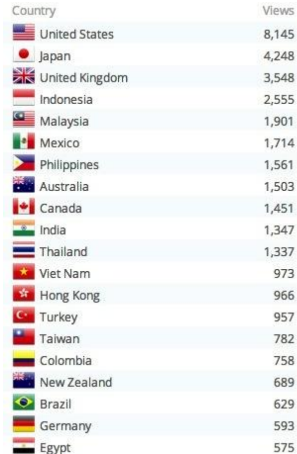
Figure 1. Number of Views in One Year by the Top 20 Countries (from November 1 2012 to October 31 2013)

Research Question 2 asked how diverse the readers of the journal was in terms of location. Readers of SiSAL Journal in a one-year period (from November 1 2012 to October 31 2013) were based in 169 different countries. The 20 countries from which the journal was accessed most often during this time are listed in Figure 1.